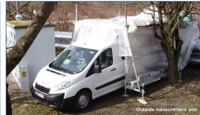
Outside measurement site