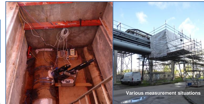
Various measurement situations

Until summer 2022 more than 200 flow sensors of district-heating and drink water supply were calibrated on-site. About one fifth of the calibrated flow sensors showed a significant or rather high measurement error. These numbers confirm the importance and the benefit of the on-site calibration method for flow sensors.