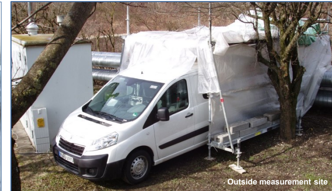
Outside measurement site