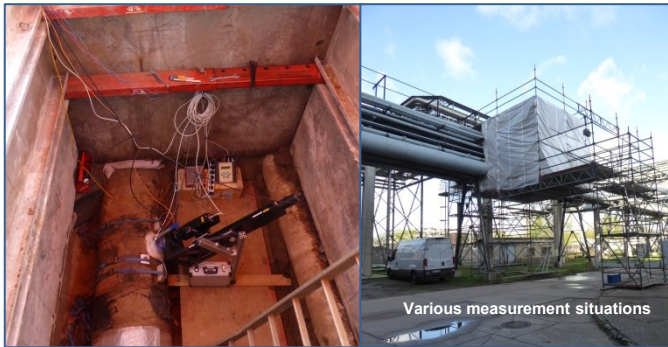
Various measurement situations

By the end of 2024 more than 230 flow sensors of district-heating and drink water supply were calibrated on-site. About one fifth of the calibrated flow sensors showed a significant or rather high measurement error. These numbers confirm the importance and the benefit of the on-site calibration method for flow sensors.