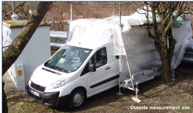
Outside measurement site